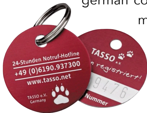
Tasso collar tags provided to every registered dog

Adopt A Street Princess already started this process in 2016 by partnering with the Tasso Worldwide Registration Database, a German company that manages the largest database of microchip registrations in Europe. This process has already helped reduce stray dogs in Kuwait, with careless owners being reminded that their dog is registered under their name and that they are responsible for the pet they adopted.