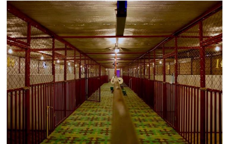
One of the kennels at Adopt A Street Princess Shelter in Kuwait

One of the most important and active jobs of a shelter is to find loving new homes for the dogs. Shelters are not ideal homes for dogs but a necessary half-way house. The ideal situation is for the dog to find a loving family that will take it in and make it a part of their family, for life. AASP is proud to have adopted thousands of dogs in the past years both to families in Kuwait and abroad.