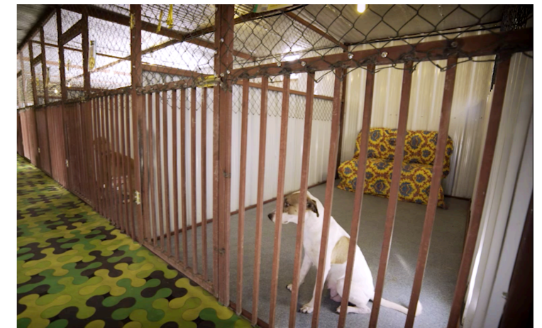
AASP tries where possible to provide "home comforts" like sofas